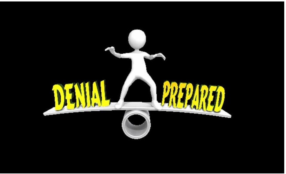
Do you choose Denial or Preparedness?

When it comes to your personal safety you have a choice to make on how you will proceed. You can choose denial or you can choose preparedness . To choose preparedness is to choose safety. Choosing denial is an acceptance of the status quo. For people who are safety-oriented the decision is clear and obvious. Yet there are many people who rarely, if ever, think about personal safety. Safety is an afterthought in response to an incident they see on the news, someone they know is victimized, or they become the victim of a violent act. Being reactive is a failed plan especially when your safety is involved.